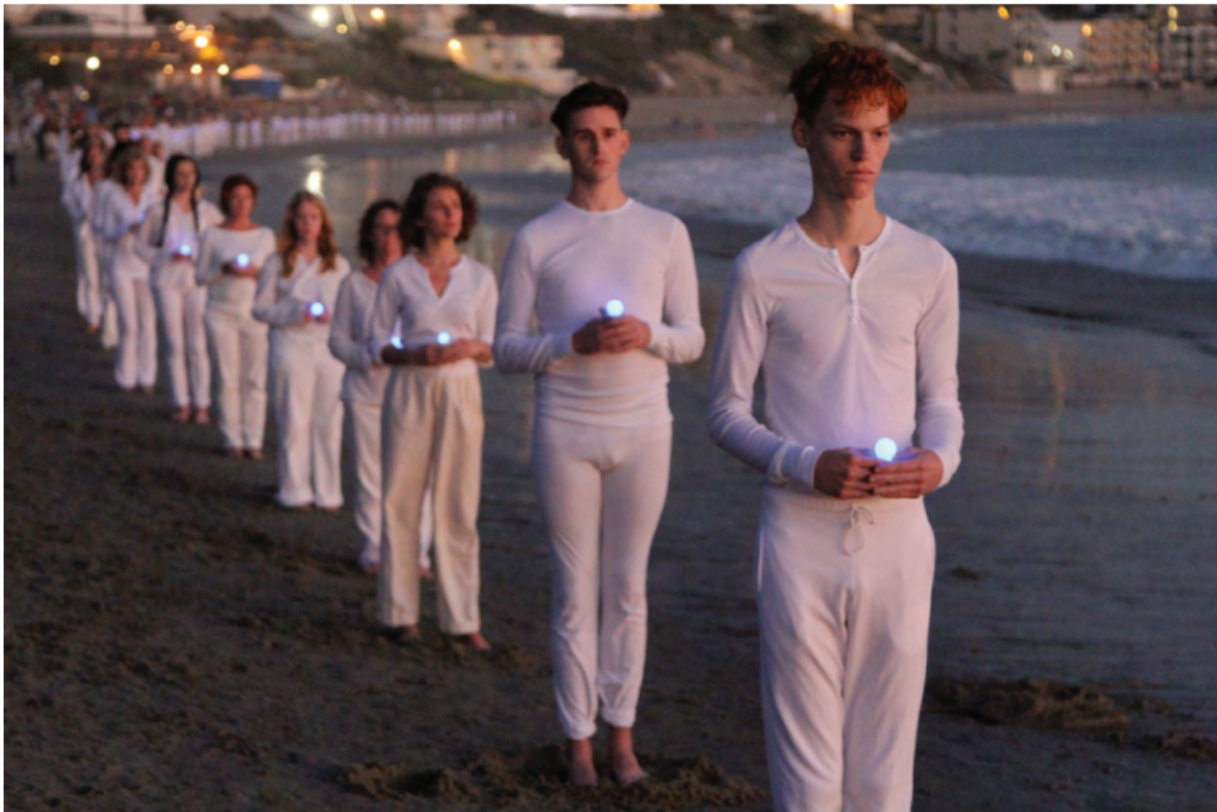
Spine of the Earth 2012, 2015 (from Spine of the Earth 2012, performance for the Getty Museum Pacific Standard Time Performance and Public Art Festival, Baldwin Hills Overlook, Los Angeles, 2012). Inkjet print, 50 x 60 inches.

Yes. From a circle to a line. It was like that. And people actually told me they could see it from the freeway! I had called it Spine of the Earth when it was flat, and then the 2012 version was literally like a spine.