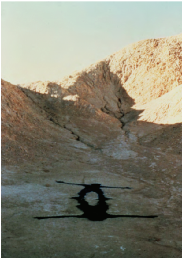
Man and the Mountain #1, 1978. Death Valley, California.