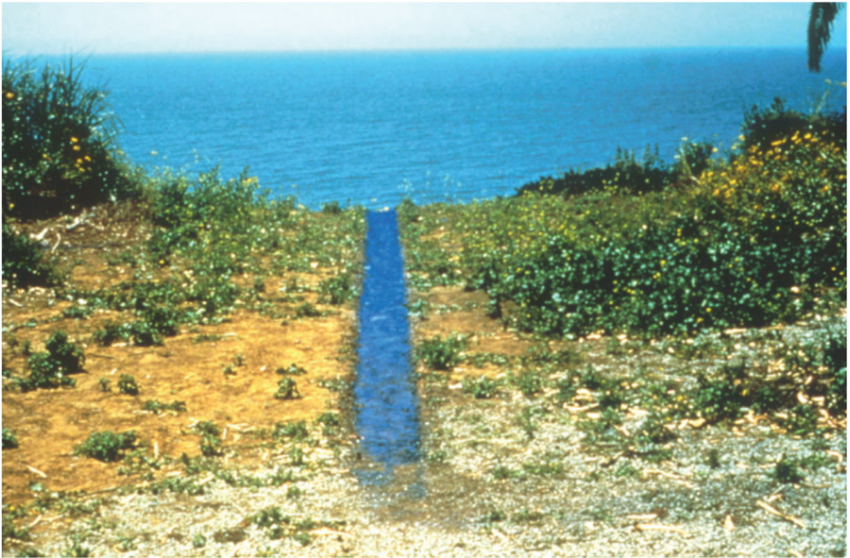
Malibu Line, 1978. Pigment, 41 feet x 14 inches. Courtesy of the artist and Kohn Gallery.

Those transitory works like Blue Rock , where the pigment on the rock gets blown away, there's entropy, and that's part of the universe winding down. And this is back to consciousness—is that piece a small version of that overall degeneration?