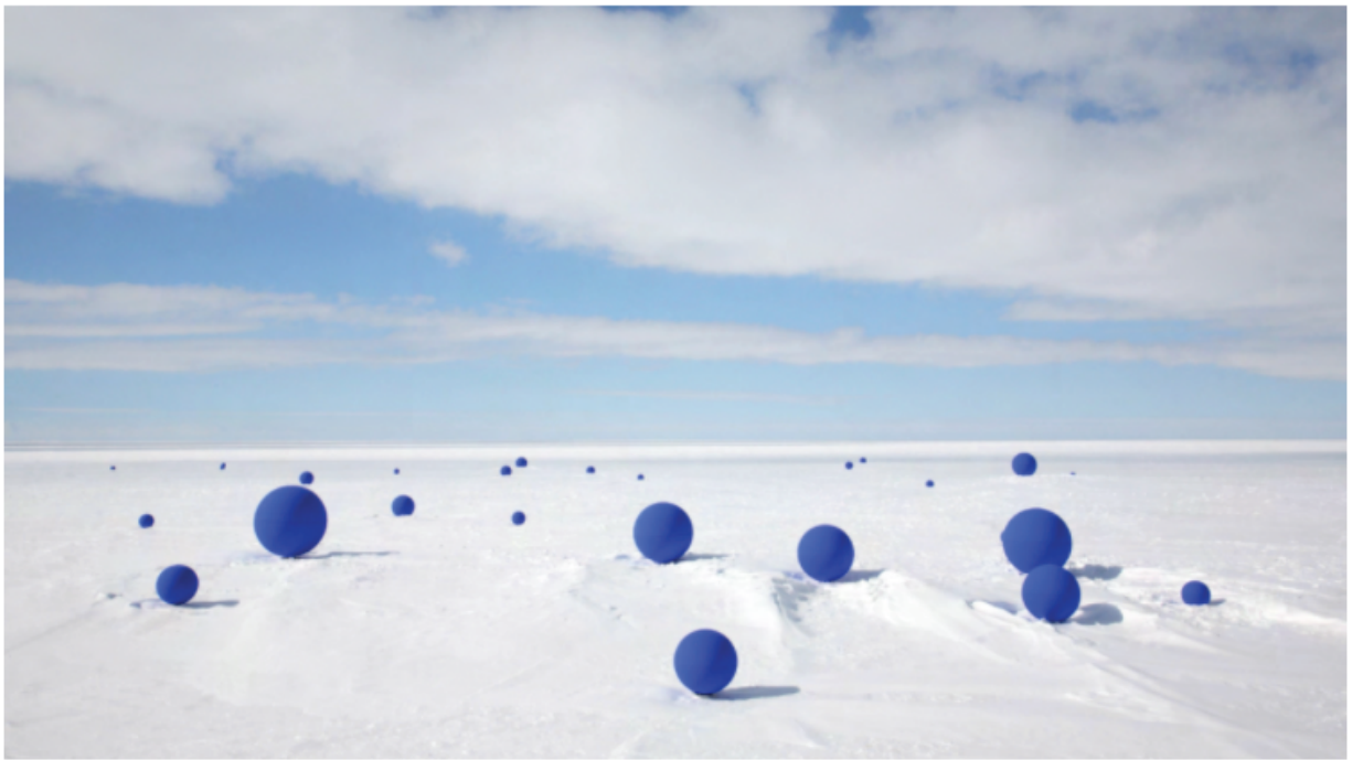
Southern Cross, 2014 (from Stellar Axis: Antarctica, Ross Ice Shelf, Antarctica, 2006). Inkjet print, 50 x 60 inches.