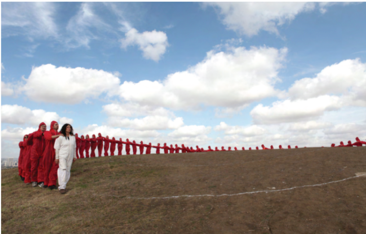
An Elongated Now, 2014. Documentation of performance for the Laguna Museum of Art, Art and Nature Festival. 300 performers dressed in white parallel the arc of Main Beach, Laguna over 3/4 of a mile. Laguna Beach, California.

Yes, I wrote the original narrative in 2003, and I did not use it in my work until 2014 with Particle Horizon exhibited at the Laguna Museum of Art. But first I want to show you something called An Elongated Now , which I did at the Laguna Art Museum in 2014 which served as a prologue to Particle Horizon . The original idea was for hundreds of people dressed in white to go on the arc of the beach in Laguna and point to the sunrise, all watch the sunrise, so they would be all pointing, and then at noon, and then at sunset, and then come back. But it was impossible.